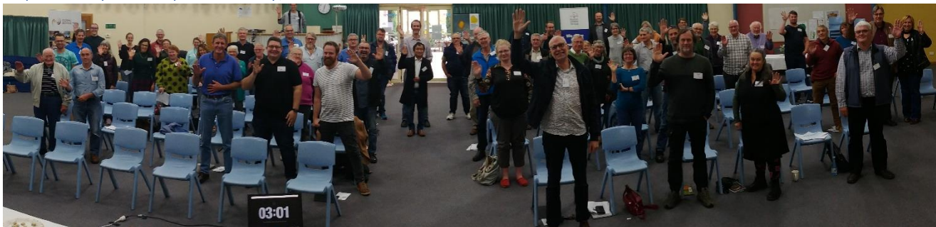
Above: Delegates at the May Assembly 2021

7pm Friday to 3:30pm Saturday, 22 nd and 23 rd October